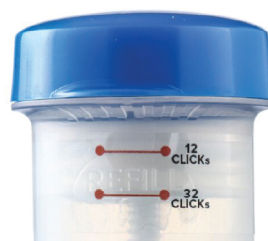
Topi-CLICK® Refill Awareness Label™

Topi-CLICK® Refill Awareness Labels™ SKU#: DL0035 Description: Refill Awareness Labels for 35mL Dispensers Quantity: 90 Labels