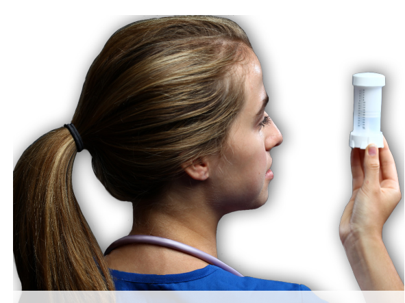
Provides an independent check system to verify dose.